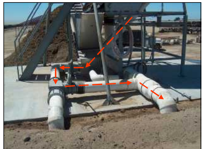
Fig 3 Back-flush Direction