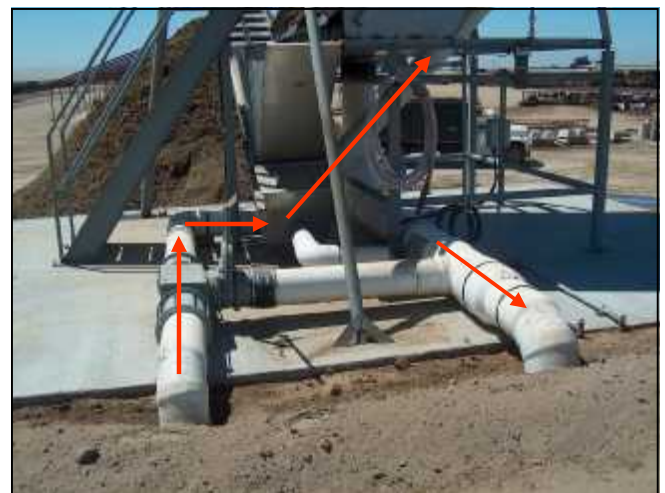
Fig 2 Normal Flow Direction